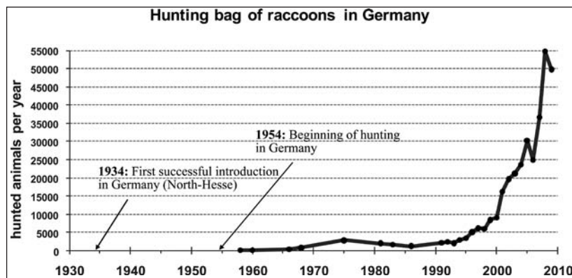
FIGURE 3: Annual number of raccoons killed by hunters in Germany.

distinct temporal pattern in raccoon rabies (Rupprecht, 1992). Torrence et al. (1992) reported on a bimodal pattern with peaks in late winter and early fall whereby the highest and lowest incidence was observed in late winter and the summer months, respectively. These two peaks are very similar to the fox rabies incidence and have been associated with the mating season (January to March) and dispersal of the juveniles in autumn, two periods with increased intraspecific contact rates and aggression.