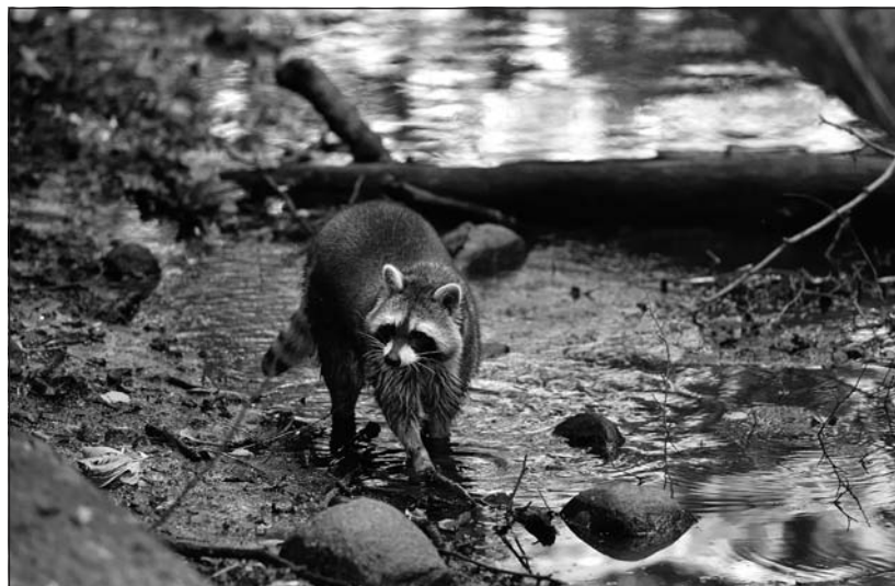
FIGURE 1: Raccoon – Procyon lotor.

The first free-living raccoons were observed in Germany approximately 80 years ago. Today Germany accommodates the largest raccoon population within Central Europe. In the late 1920s raccoons were precious fur bearers and during this period escapes from enclosures and attempts to introduce the animals in the wild were documented for the first time (Müller-Using, 1956). However, these early escapees and deliberate efforts to introduce raccoons failed. The first successful introduction took place in 1934, when four raccoon (two females and two males) were abandoned at Edersee, Hesse. This